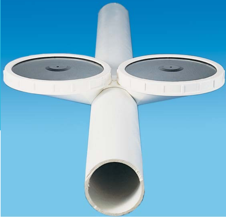
DualAir® diffuser with membrane media.

The EPDM membrane media is a high pressure injection molded compound using a well proven formula that has superior rebound memory. It will last up to 10 years, even at high airflow rates. The membrane includes precision perforated "I" slits that resist tearing and stay cleaner, longer. They open when airflow is present, close when airflow is stopped. A thick center prevents ballooning and the unique tapered membrane cross section guarantees equal fine bubble distribution across the entire surface. When ceramic media is supplied it meets or exceeds all industry standards for strength and performance.