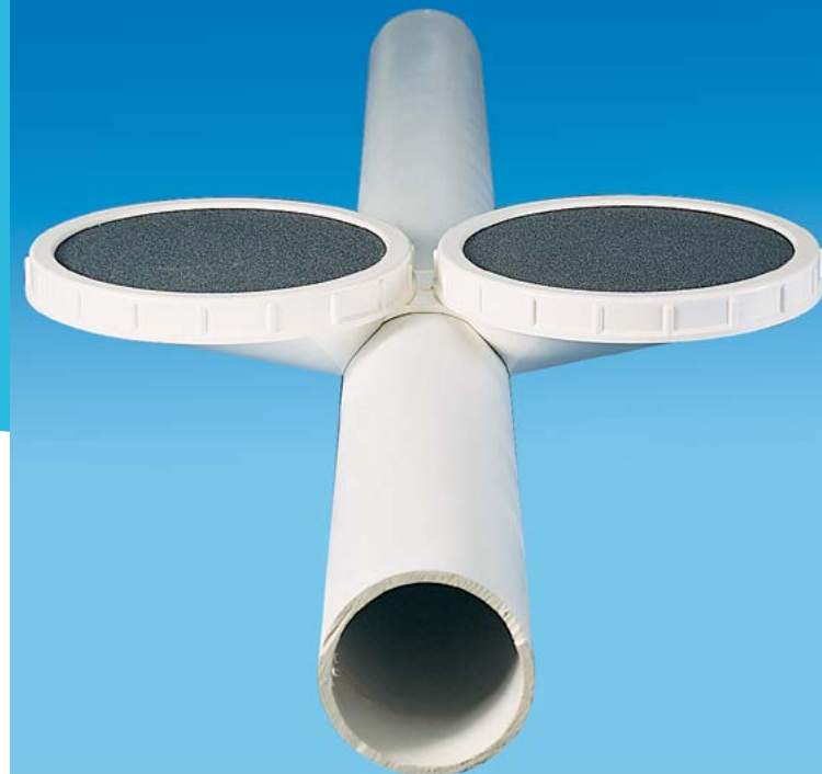
DualAir® diffuser with ceramic media.