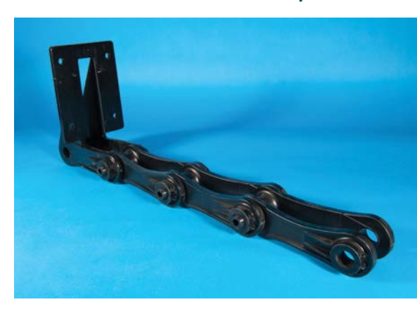
Collector Chain NCS720S - The worldwide standard for molded chain