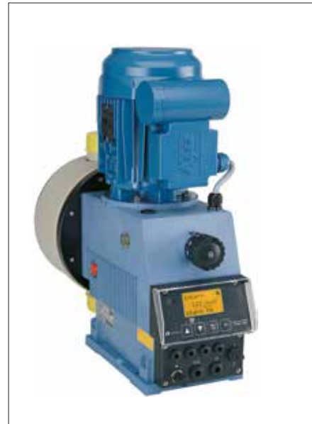
Chem-Ad Series D