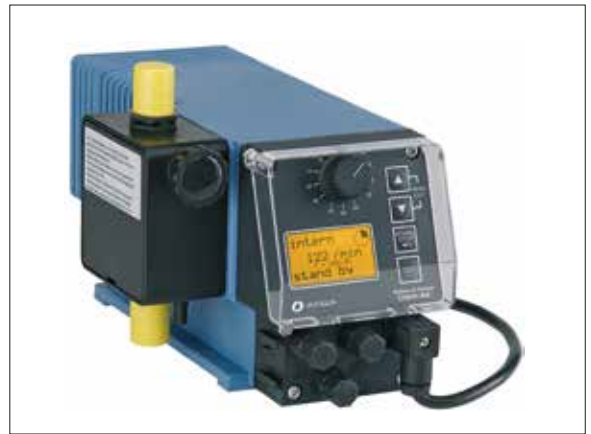
Chem-Ad Series B