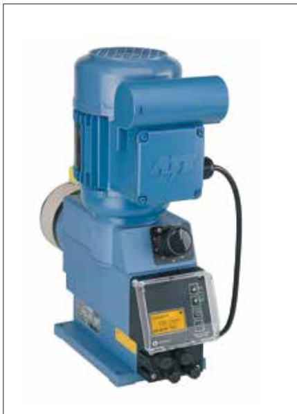
Chem-Ad Series C