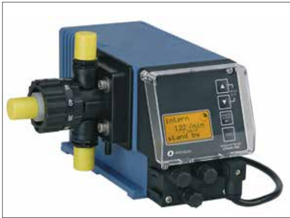
Chem-Ad Series A