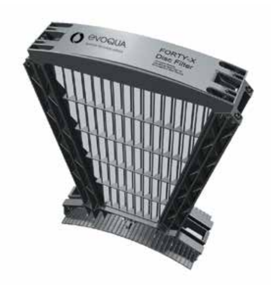
The pleated surface of the Forty-X<sup>™</sup> disc filter panels dramatically multiplies the filtration surface area.

The inside-out filtration flow, combined with the dynamics of the central influent drum adds further to the simplicity of the Forty-X disc filter by eliminating the need for a separate system for handling floating and sinking material. The Forty-X disc filter effectively isolates trash so it is easily and quickly transferred to the reject flow.