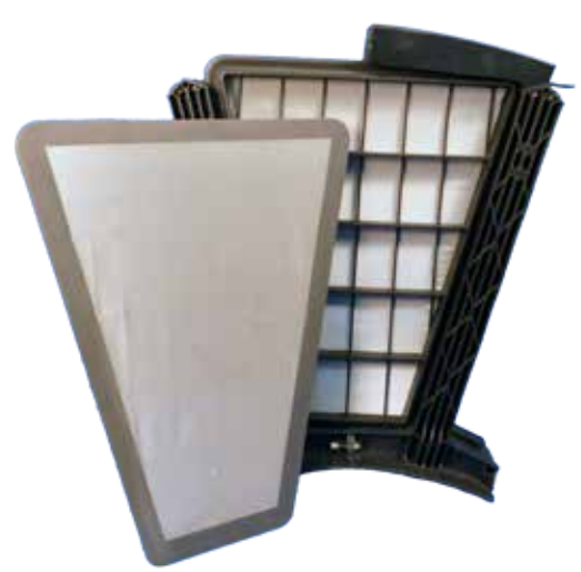
Durable stainless steel disc filter panel improves solids retention.

The Forty-X<sup>™</sup> Disc Filter Armor series offers a modular design that is flexibility and dependable for municipal and industrial filtration applications. The pre-screen is like "Armor" for the disc filter, providing initial filtration of large organic and inorganic materials.