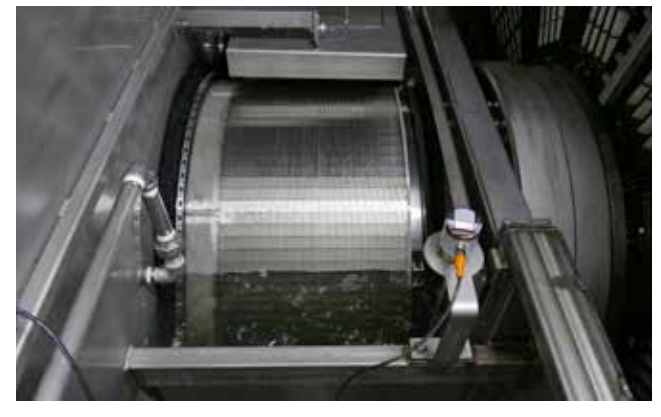
The Forty-X<sup>™</sup> Disc Filter Armor series includes an integrated pre-screen designed to protect the disc filter by removing large organic and inorganic materials.

The Forty-X Disc Filter Armor series uses one common backwash pump and level sensor for backwashing both the pre-screen and disc filter panels. The captured solids are backwashed into a reject trough using this positive pressure spray cleaning system. The level sensor is located in the influent channel and automatically controls the backwash cycle. Both the pre-screen and disc filter continue to filter during backwash. The weave pattern of the stainless steel panels allow greater loadings per square foot and as a result less backwash cycles.