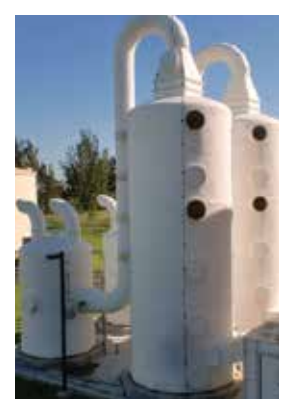
Carbon Adsorbers used as polishing units following a Biotrickling filter.