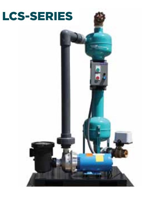
Includes: VHS separator, isolation valve and manual purge valve mounted on a painted steel skid. Options include auto purge and bag recovery vessel.