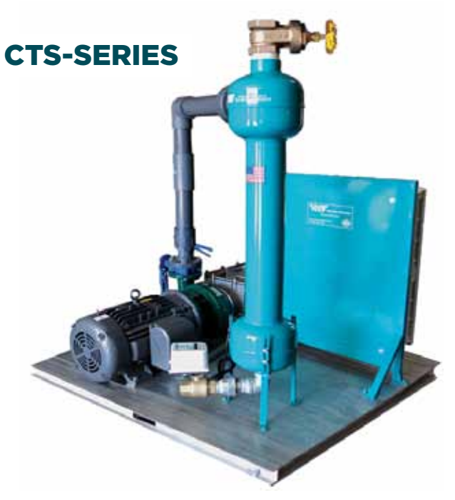
Includes: VHS separator, isolation valve, automatic timer and purge valve and pump strainer mounted on an epoxy coated steel skid. Options include bag recovery vessel.